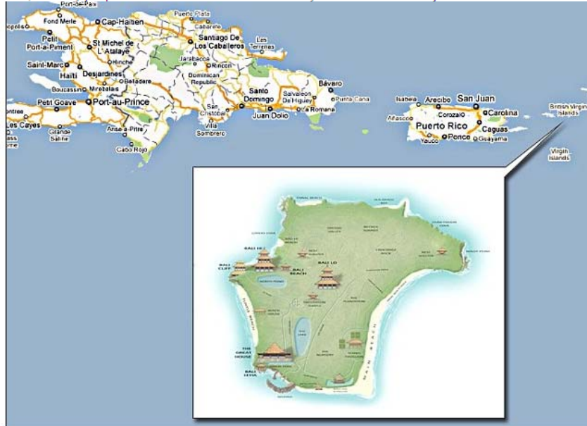
Necker Island resides in the British Virgin Islands in the Caribbean. It has features such as Orchid Valley and Honeymoon Cove