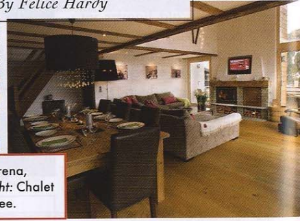
Left: Chalet Serena, Chamonix. Right: Chalet Jessica, Saas Fee.

BEST WINE LIST Fretwork and fondue rule in stuffy Saas Fee, but Chalet Jessica bucks the trend. It's a sleek duplex perched atop the main street, and comes with an ex-Scott Dunn chef, gizmos galore, one of the finest panoramas in the