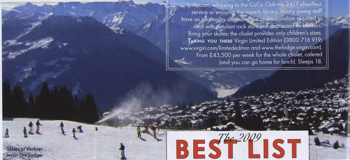
Skiers at Verbier. Inset: The Lodge.

BEST SKATING RINK How very bling to have a private 60-square-metre skating rink. But The Lodge in Verbier, owned by Richard Branson, is the ultimate Alpine playzone: the basement party room has a daybed for ten, dancefloor, pool table and bar. That's for when you're not in the gym, swimming pool, home cinema or hot tub (indoor and outdoor), playing with rubber ducks in Branson's bathroom, whizzing to the CoCo Club via 24/7 chauffeur service or enjoying the superb library. Merry young staff have an informality disguising the professionalism required to deal with petulant rock stars and depressed ex-bankers. Bring your skates: the chalet provides only children's sizes. TAKING YOU THERE Virgin Limited Edition (0800 716 919; www.virgin.com/limitededition and www.thelodge.virgin.com ). From £43,500 per week for the whole chalet, catered (and you can go home for lunch). Sleeps 18.