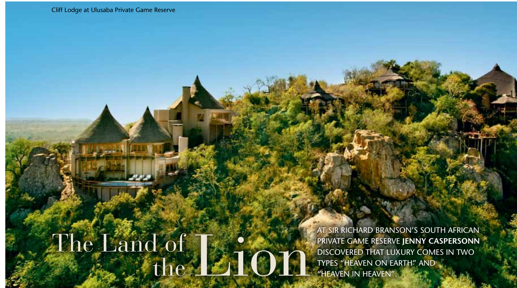
Cliff Lodge at Ulusaba Private Game Reserve