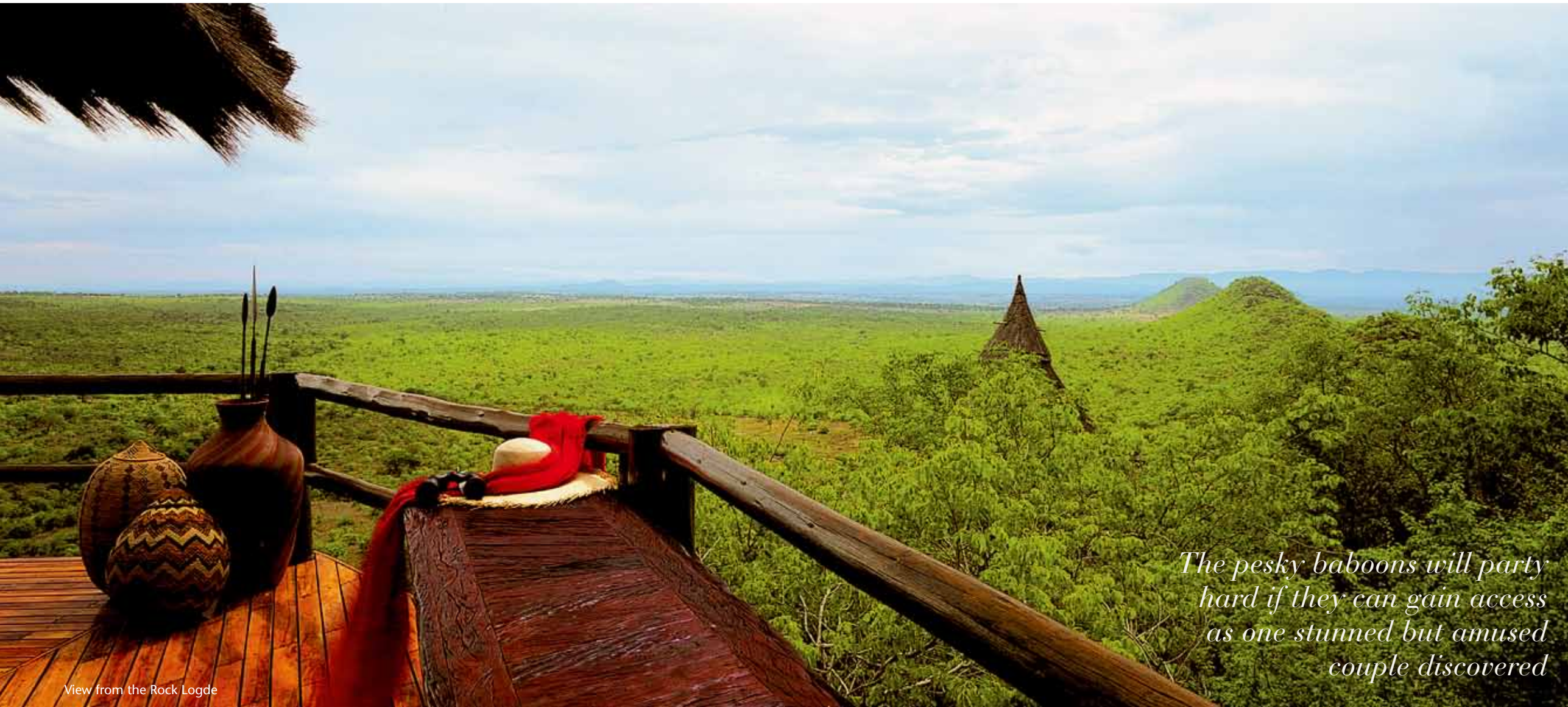
View from the Rock Lodge

The pesky baboons will party hard if they can gain access as one stunned but amused couple discovered